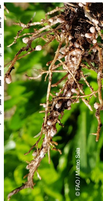
Roots with rhizobia nodules (N-fixing)