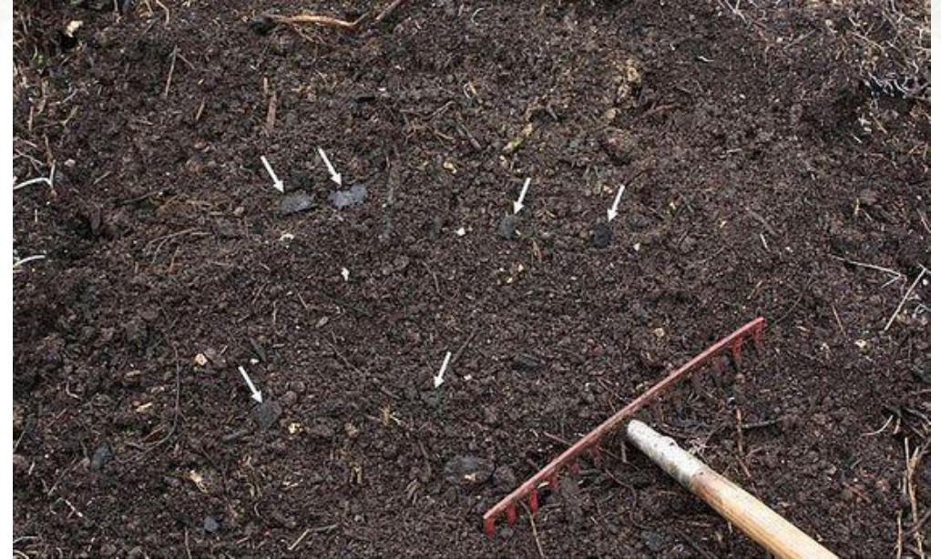
Terra Preta, Amazonia