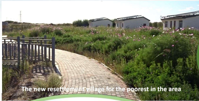
The new resettlement village for the poorest in the area