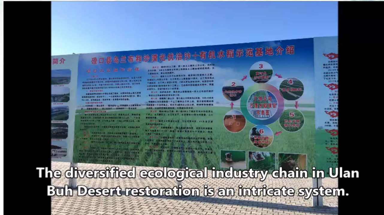
The diversified ecological industry chain in Ulan Buh Desert restoration is an intricate system.

It enhances and sustains the momentum of recovery with the support of logistics and e-commerce.