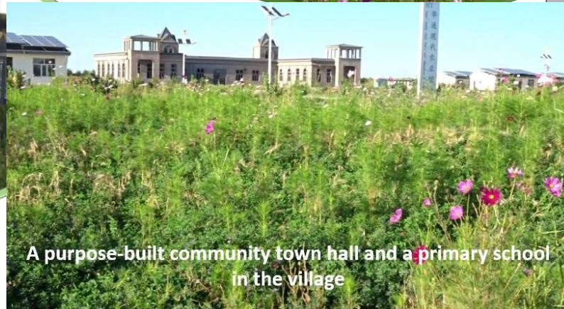
A purpose-built community town hall and a primary school in the village