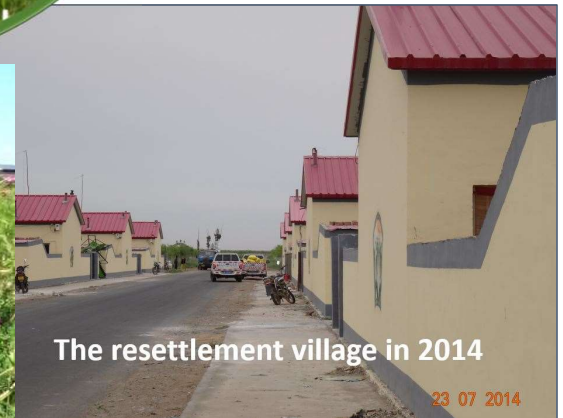
The resettlement village in 2014