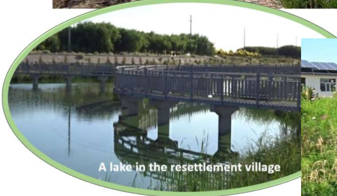
A lake in the resettlement village