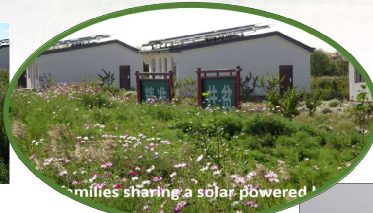
Families sharing a solar powered